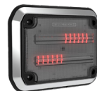
X - Pattern